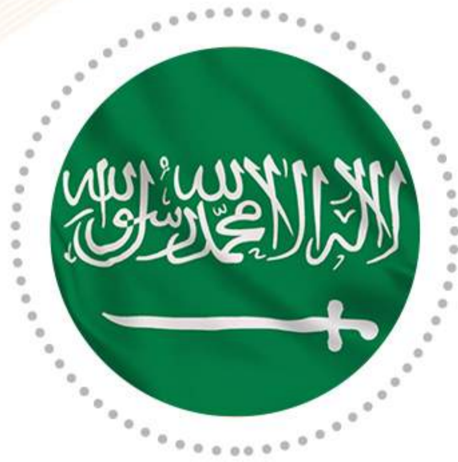
SAUDI ARABIA (SPLE)

PrExam Course are Designed to Support the Following Exams